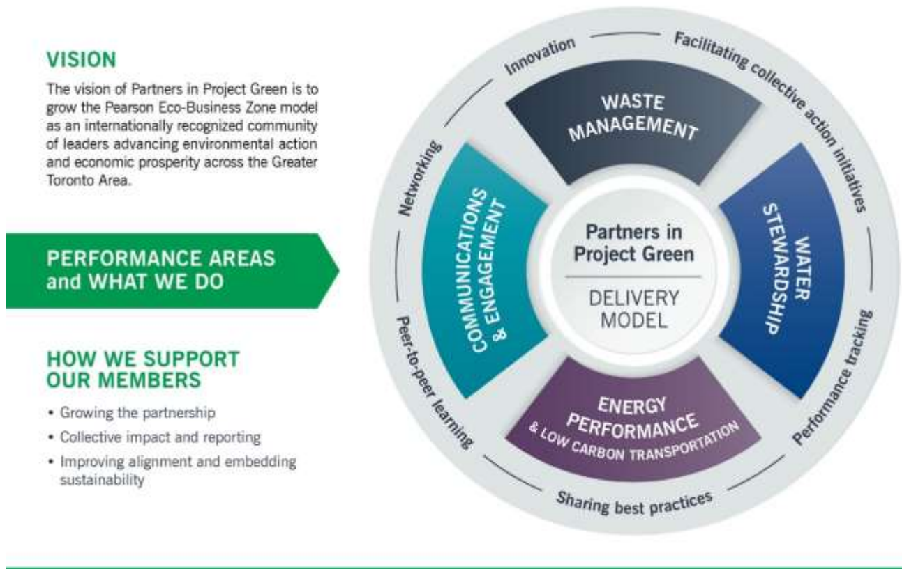
Figure 2. PPG’s Strategic Refresh – program and focus area delivery model