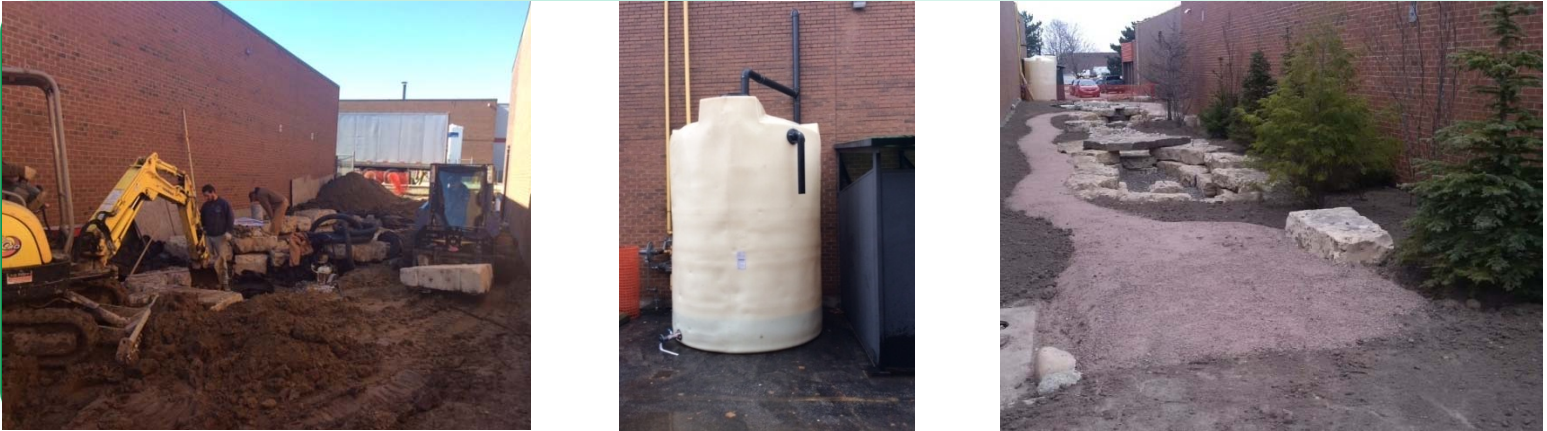
Above, from left to right: Calstone Inc. site during construction; one of two rainwater harvesting tanks; view of porous walkway and infiltration ponds from the back of the facility

These stormwater best management practices set Calstone apart from other medium-sized businesses in the area by providing a distinct, enhanced green space for employees and showing dedication to exemplary water stewardship within the Highland Creek watershed. Since stormwater infrastructure servicing this area is aging and does not meet current standards, this showcase of lot-level stormwater management practices demonstrates to the community ways that the cost of retrofitting municipal infrastructure could be avoided.