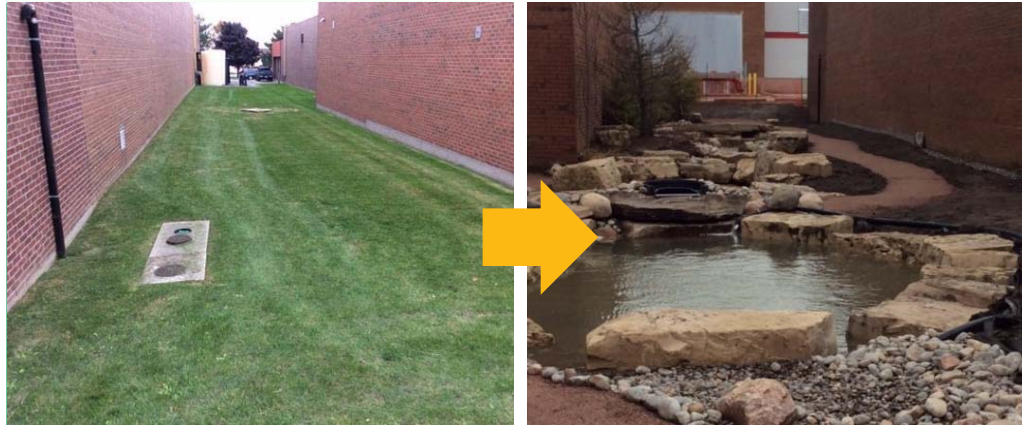
Above: Calstone Inc. site, before and after project construction

The long-term goal is to increase and replicate the number of these initiatives in the GTA by taking a collaborative approach to their execution and completion.